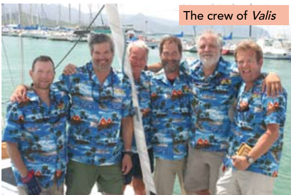
The crew of Valis